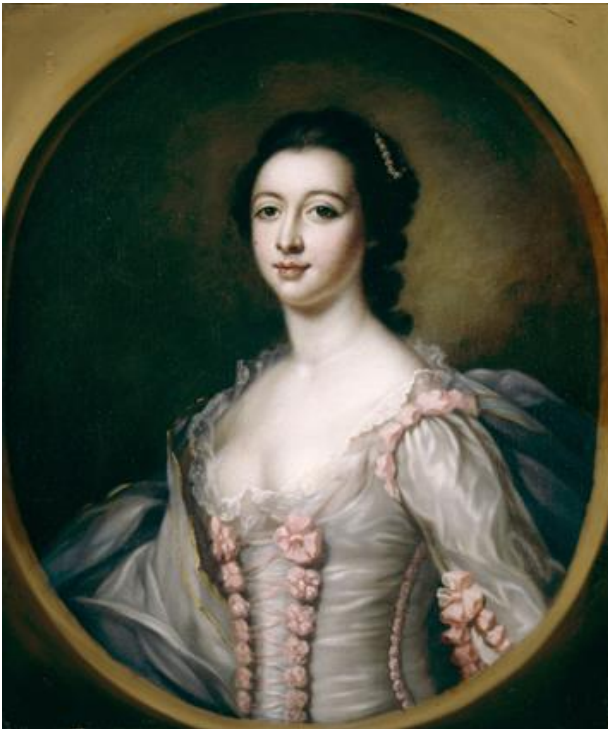
Francis Cotes, The Countess of Coventry , 1760.

This pigment's poisonous effects have been known since at least the Roman Empire. Pliny the Elder included lead white in his Natural History . 5 Despite this, it was only over the course of the twentieth century that its legal distribution in the West ended. 6 However, it is still sold on the global black market, including in European cities like Antwerp.