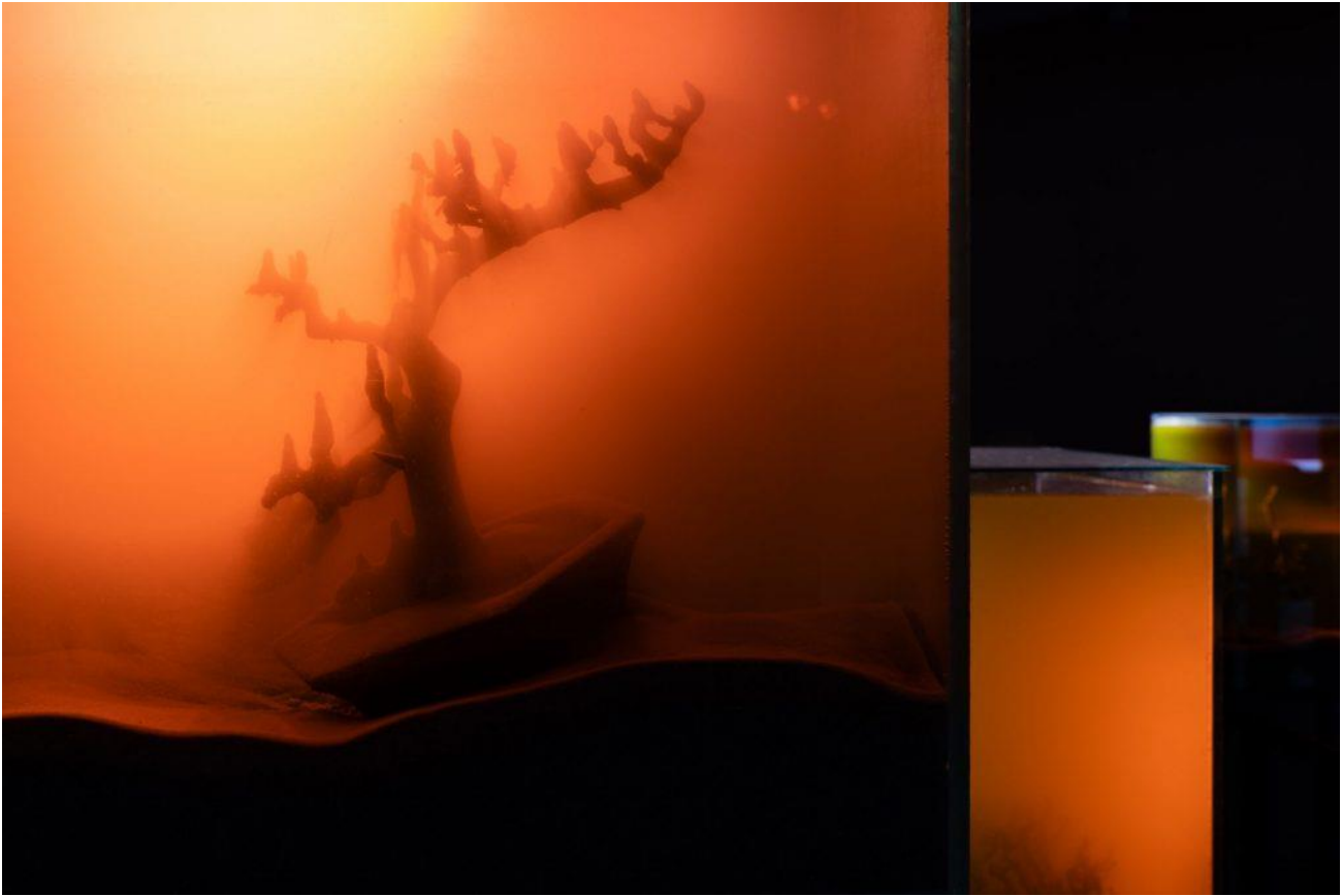
Various artists, toxiThropea.sunset , 2019, Deadly Affairs (23 March–30 June 2019), Kunsthall Extra City, Antwerp.

Deadly Affairs aimed to dissect how the unequal distribution of environmental catastrophes is intertwined with capitalism, imperialism, and race. We used the tropes of toxic trades and destruction to untangle the complex conditions that make its violence possible, and above all legally, socially, and culturally acceptable. At the heart of the exhibition were these malevolent processes of “normalization.” We tried to emphasize how local populations often accept hazardous and toxic industrial endeavors in exchange for promises to solve unemployment and poverty. Valentino Bellini, in collaboration with Eileen Quinn, addressed this by merging investigative journalism, archival materials, interviews, and photographs related to the disastrous history of the petrochemical area of Syracuse in Sicily, and what remains of it in the environment, in human bodies, and in memories.