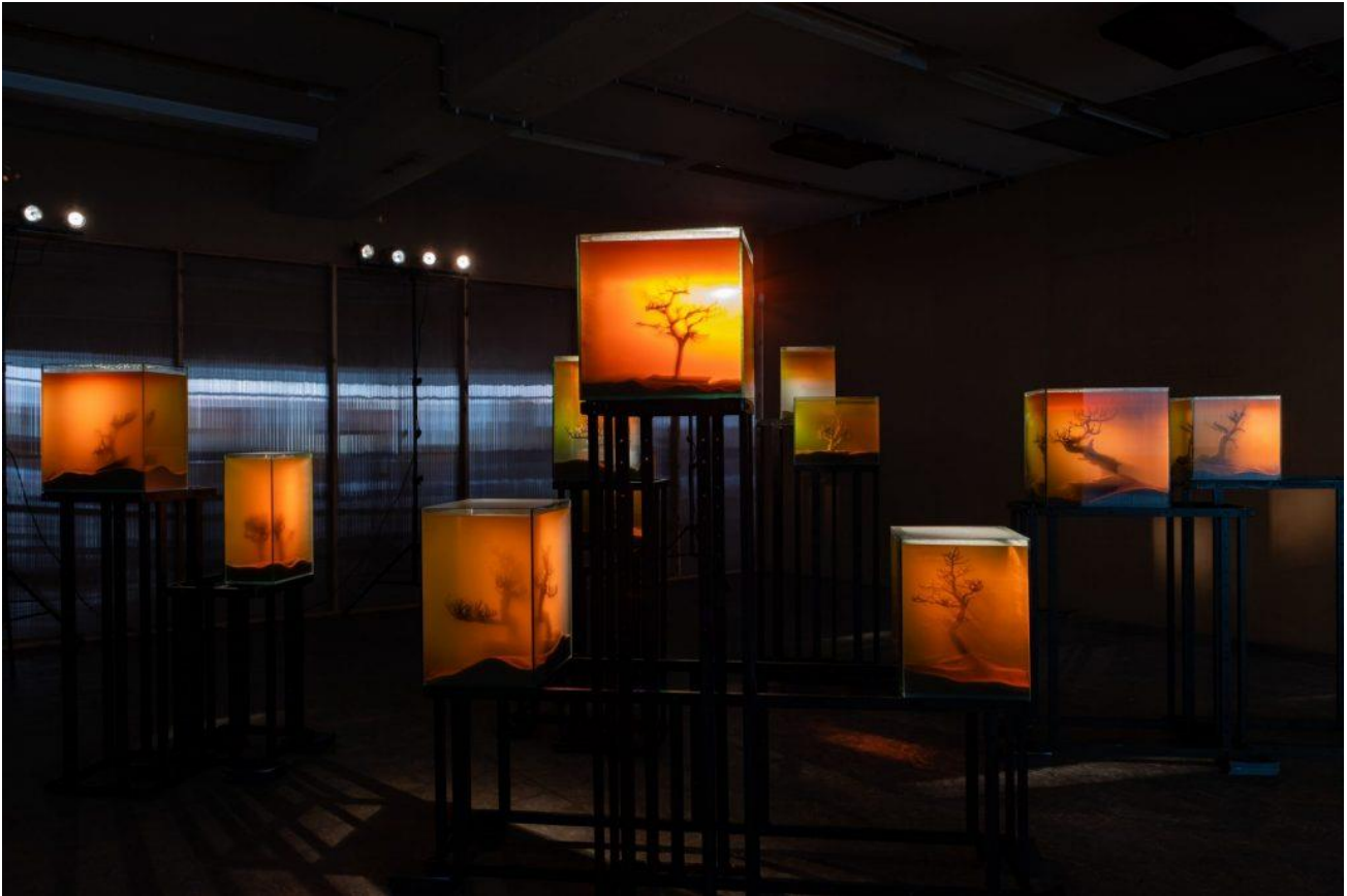
Various artists, toxiThropea.sunset , 2019, Deadly Affairs (23 March–30 June 2019), Kunsthal Extra City, Antwerp.